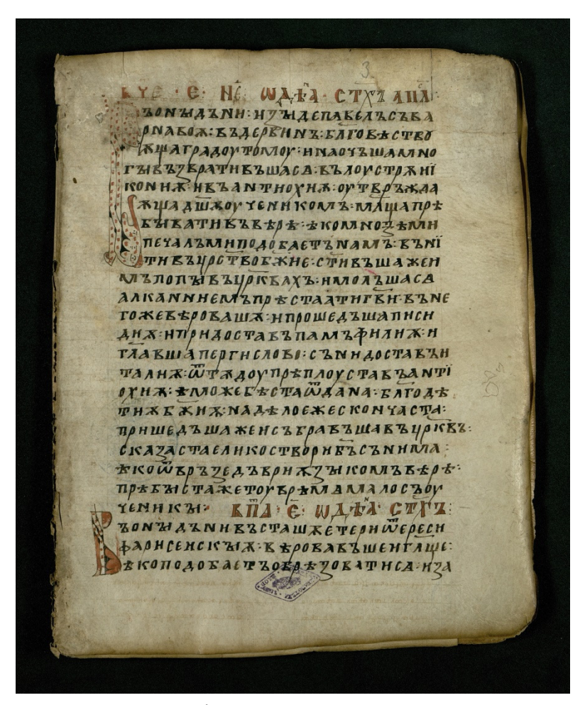
Figure 1. Apostol of Slepche, 12<sup>th</sup> c., Plovdiv Library "Ivan Vazov", No. 25 (62)