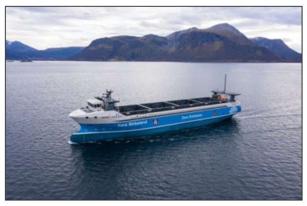
Figure 5. Yara Birkeland - self-propelled cargo ship

Yara Birkeland is not the first self-propelled cargo ship ( Figure 5 ) – e.g. The Finns have been operating an autonomous ferry since 2018 – but this is the first fully electric and autonomous container ship, with zero emissions of harmful gases.