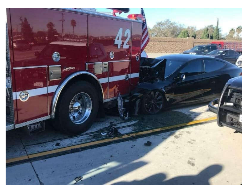
Figure 3. Tesla's collision with a fire truck

The National Highway Traffic Safety Administration (NHTSA), organization within the United States Department of Transportation, has launched an investigation about accidents caused by self-driving Tesla cars, models Y, X, S and 3, which were sold in the period from 2014 to 2021. 17 people were injured, and one person died, because the vehicles collided with the emergency vehicles of the police, ambulance and firefighters ( Figure 3 ). Although the investigation has just begun, based on the technology of self-driving vehicles, it is possible to determine what is behind this dangerous phenomenon.