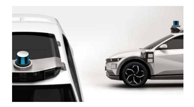
Figure 1. Ionic5 details