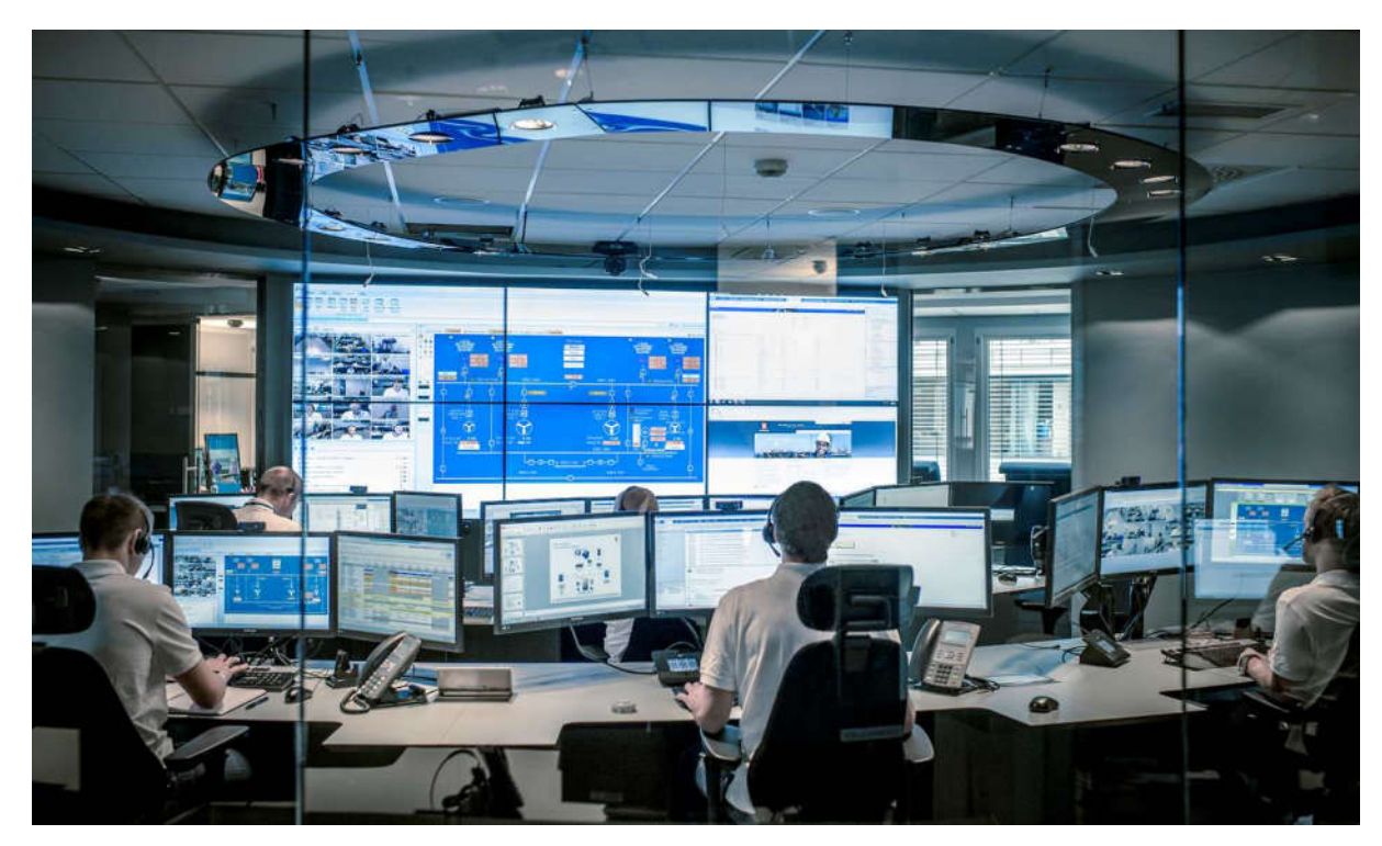
Figure 6. Yara control center