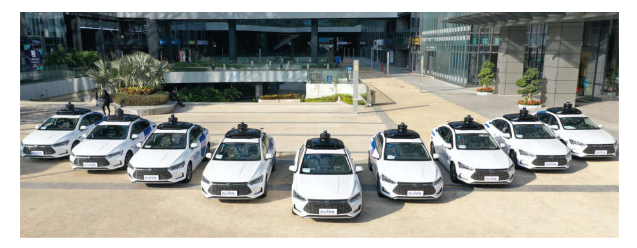
Figure 2 AutoX

AutoX (Figure 2) is one of the first autonomous vehicle development companies to receive permission from the government to begin testing its vehicles on public roads in California, without the driver behind the wheel. In July 2020, more than 60 companies tested their self-driving cars, but most of them could only put vehicles into traffic with the driver behind the wheel for safety reasons [4-7].