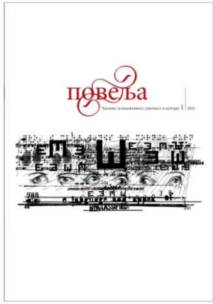
Figure 1. The first issue of the journal "Povelja" from 1971 and the last issue from 2021

With time, "Povelja" was gaining in power, holding its position stronger and more solid on Serbian cultural periodicals map. Each new issue contained the articles of significant authors from all the parts of the ex-Yugoslavia, and now it contains the articles of the authors from Serbia, the region and the whole world. The fact that authors such as Vasko Popa, Branko Ćopić, Ivan V. Lalić, Miodrag Pavlović, Dragan Velikić, Goran Petrović and many others had their works published in "Povelja" proves the undeniable importance of the journal itself.