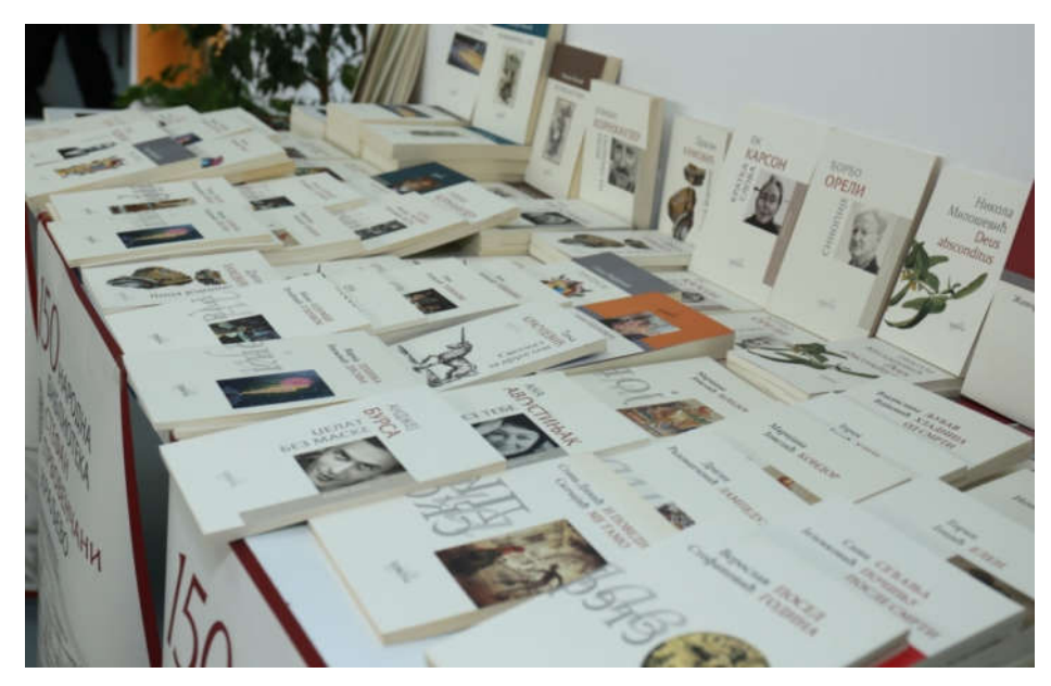
Figure 4. All the publications of the Library in Kraljevo will be digitized