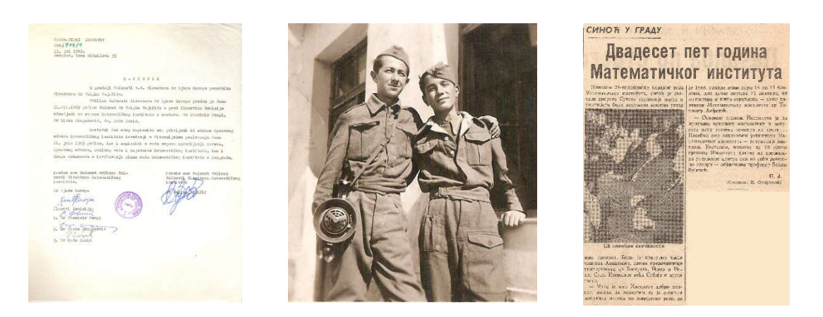
Figure 5. Examples of various archival material (Archives of the Mathematical Institute SANU)

Multiple files can be imported within each object, with a file size limit of 128 MB. Thus, for example, the object concerning the first session of the staff of the Mathematical Institute, held on September 5, 1962, at which Vujičić was elected a member of the Council, contains two files: a raster image of the original document and an unstructured text of the document.<sup>5</sup>