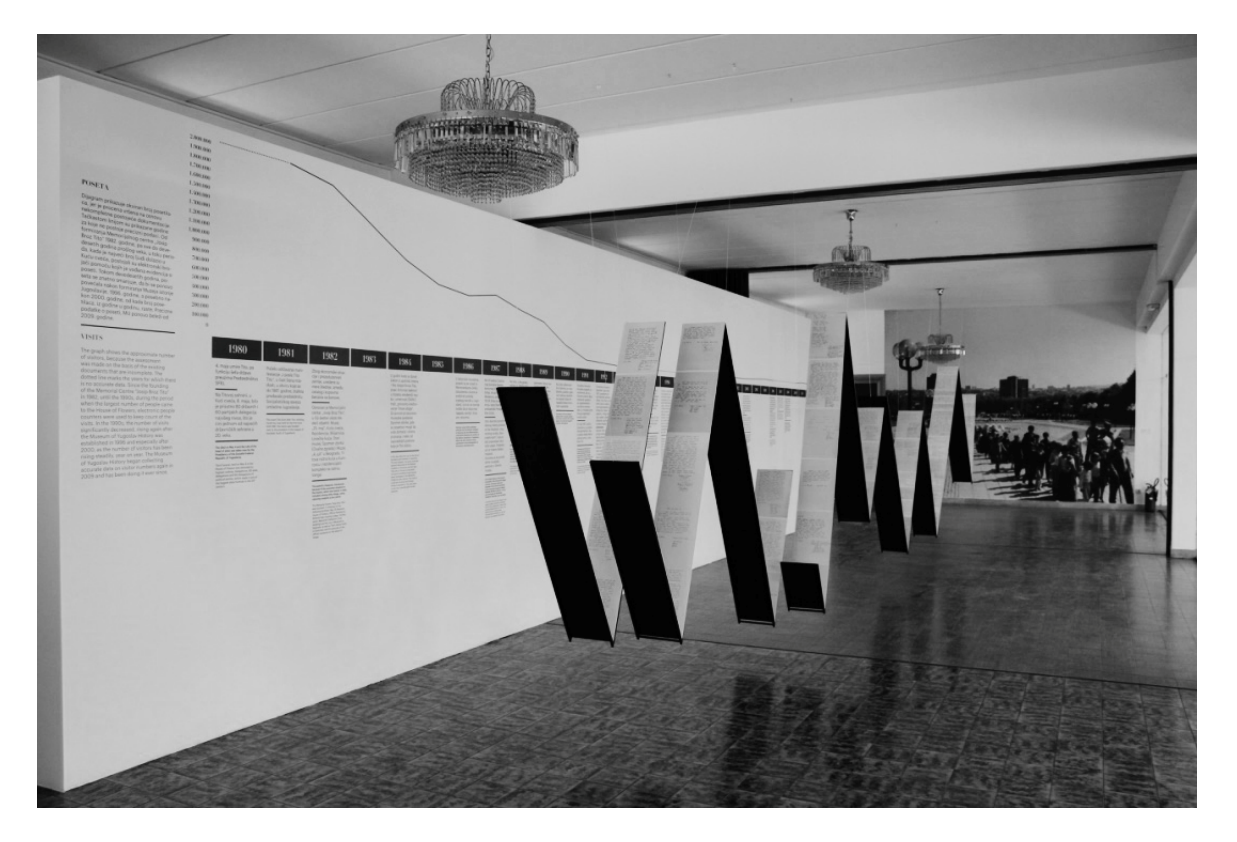
Figure 8. Exhibition "Figures of Memory", 2015.