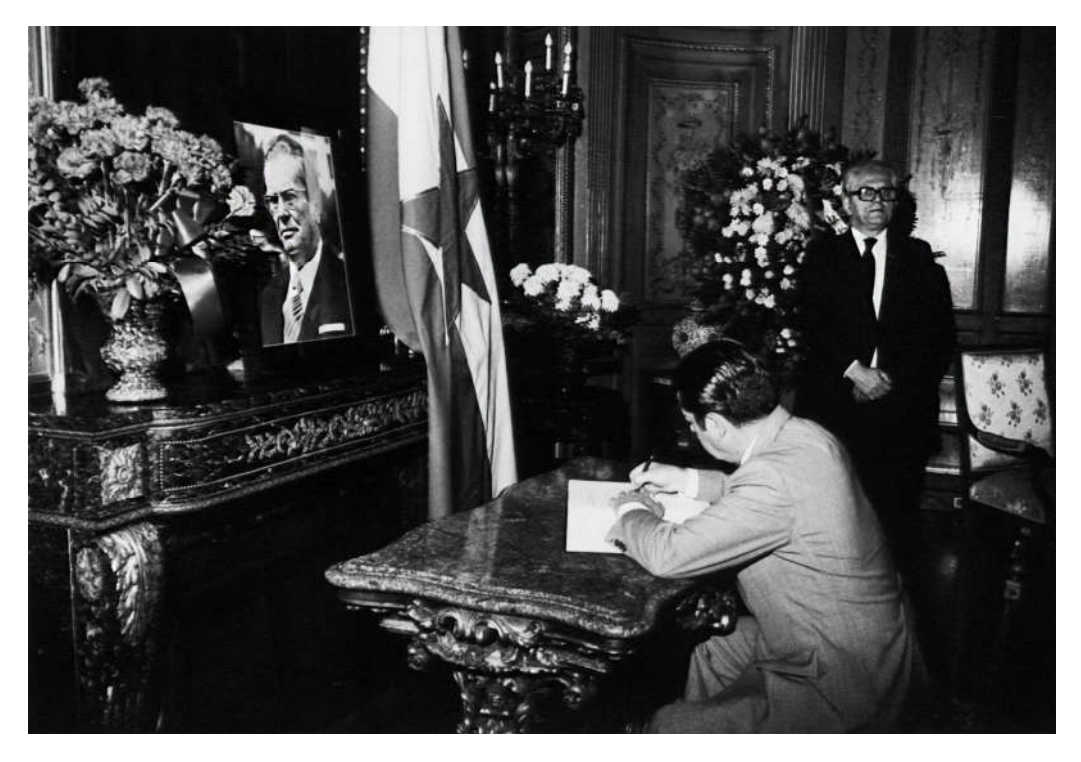
Figure 5. . Books of Condolence from Yugoslav Embassies, 1980.

Written material and supporting material created on the occasion of death of Josip Broz include: Condolence Books from the Federal Assembly of the SFRY, Condolence Books from Yugoslav Embassies opened when Tito passed away (Figure 5), photos of entries from the books themselves, telegrams, letters to the Federal Government and the Presidency of Yugoslavia, letters to the Broz family and Tito's spouse Jovanka Broz (Figure 6), letters to the people of Yugoslavia, Condolence Books of the Citizens of Yugoslavia, Condolence Books of Yugoslav workers' associations from different countries in Europe. The mentioned documents and written material are in the archive of the President of the Republic, which is housed in the Archives of Yugoslavia.