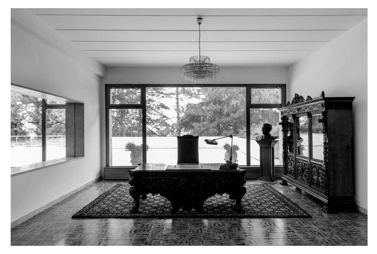
Figure 7. Memorial Room in House of Flowers