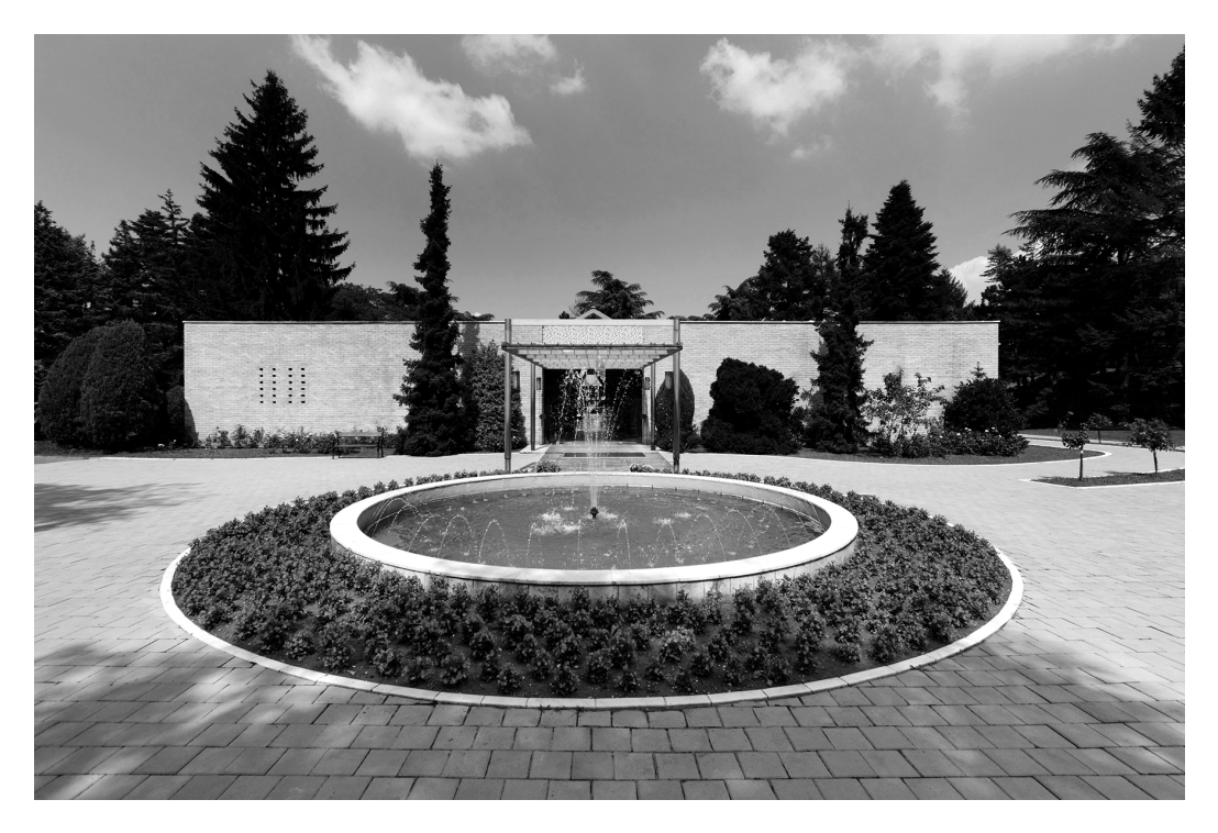
Figure 2. House of Flowers