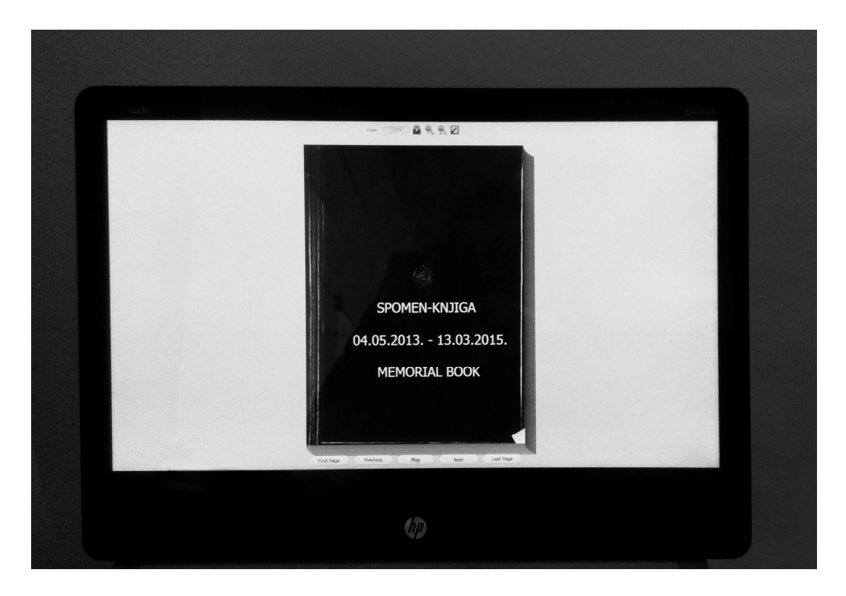
Figure 15. Virtual Time Machine, exhibition "Figures of Memory"

With this approach, the Virtual Time Machine has made it possible to materialize the memories that relate to the personality of Tito and Yugoslavia over the last 40 years. At the same time, the Museum appears in the context of social space as a medium that initiates authentic events and creates collective remembrances through collective memory.