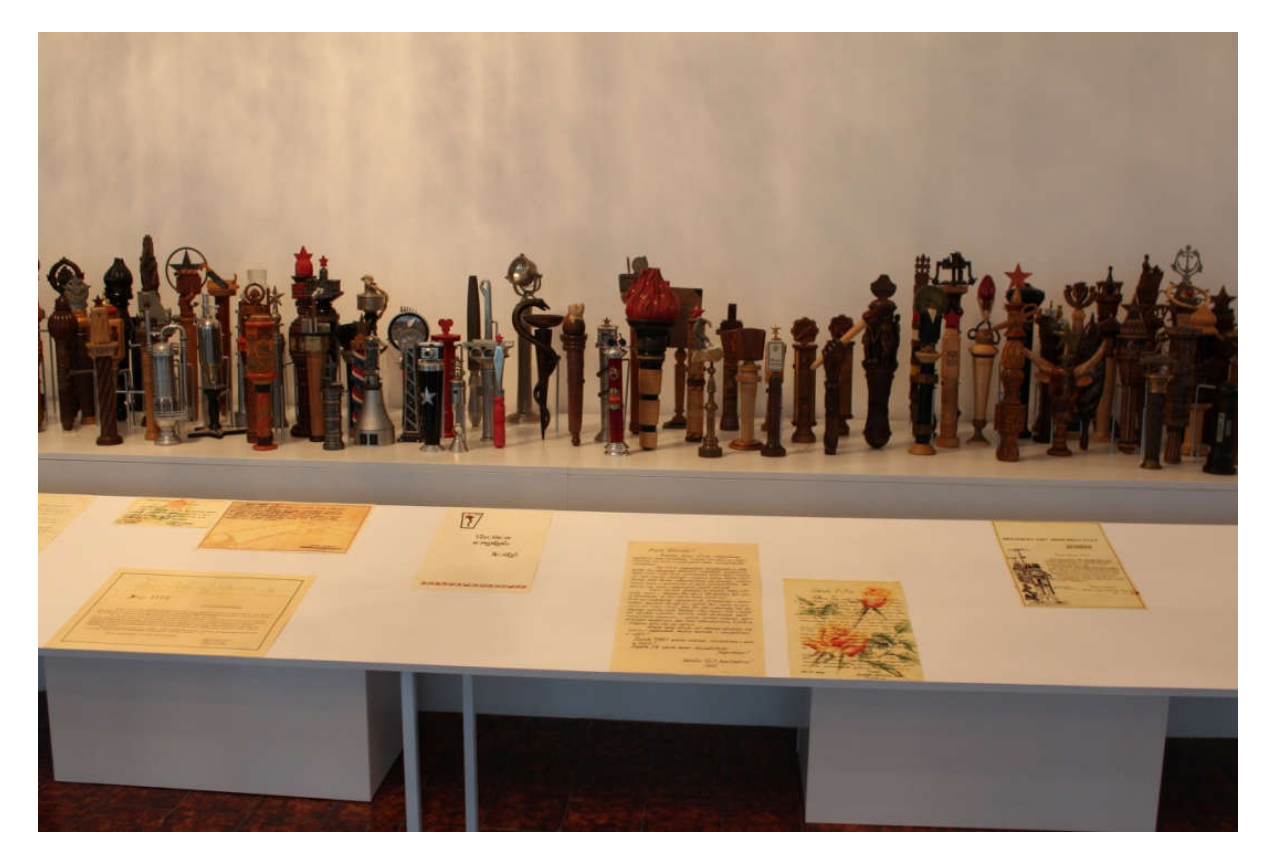
Figure 9. Exhibition "Figures of Memory", 2015.