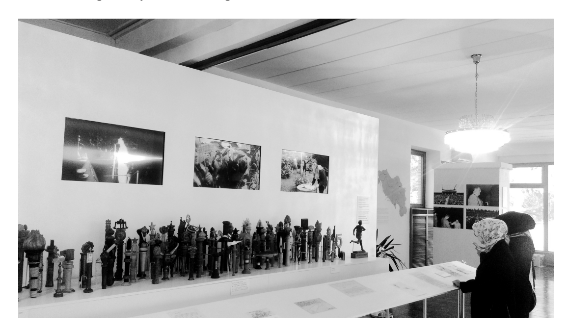
Figure 14. Videos about celebrating Youth Day, in the past and now