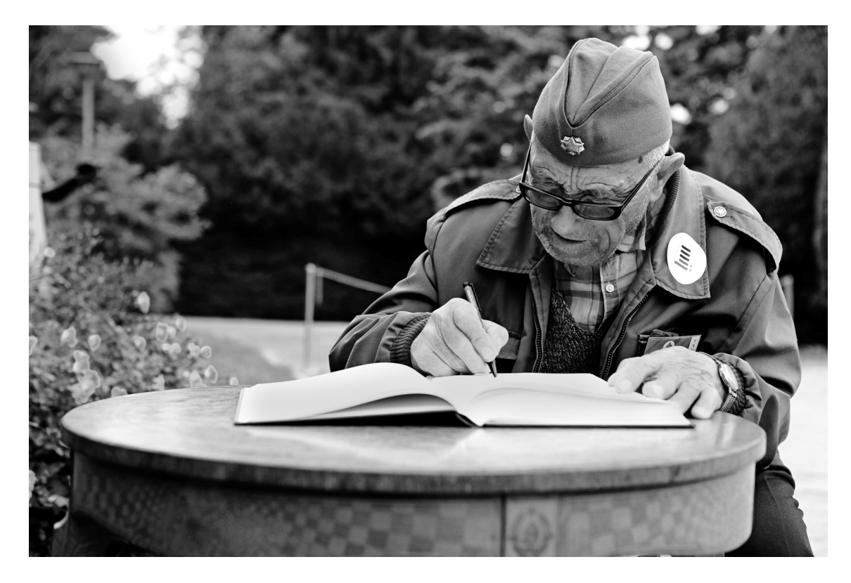
Figure 4. Visitors' Books, 2015.

May 25 Museum was founded in 1962 and was a gift to Tito for his seventieth birthday. From 1962 to 1982, the Museum operated independently with a permanent exhibition of Relays of Youth and other gifts given to Tito and Yugoslavia. Since its opening, the Museum had its Visitors' Book established to preserve exciting testimonies of the common man about different experiences, everpresent emotions, comments on displayed exhibits, on Tito, and social circumstances enabling us to see today the views of a developing society. It contains records of many public figures, citizens, the youth, companies, societies, and associations, both local and foreign ones. Visitors' Books, 139 of them, are essential because each of them has a story of a particular generation that can be viewed