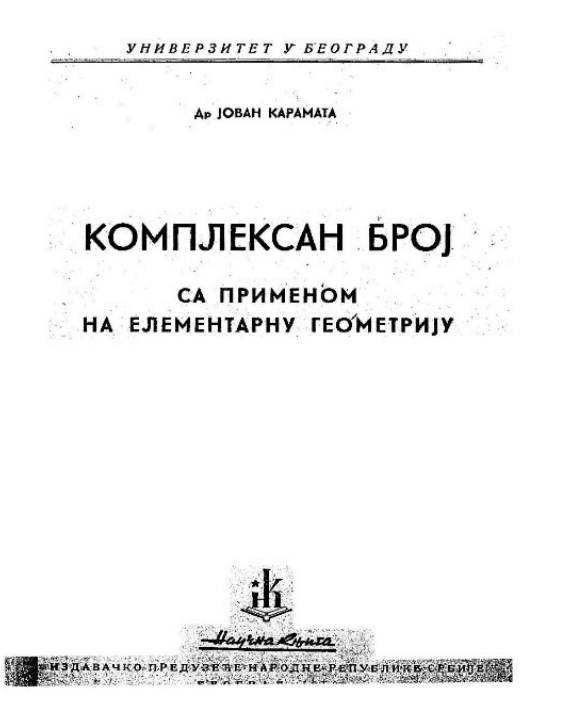
Figure 3.The cover page of the university textbook Complex Number .

Jovan Karamata has published 120 scientific papers, 15 monographs and textbooks, as well as 7 professional-pedagogical works. Digital copies of 29 of these works and books are in the Virtual Library of the Faculty of Mathematics in Belgrade, <u>http://elibrary.matf.bg.ac.rs</u>. Here we give an overview of the university textbooks Complex Number and Theory and Applications of Stieltjes Integral .