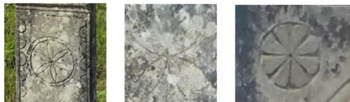
Figure 11: Examples of rosettes on the head gravestones

Beside the crosses, frequent symbols are rosettes with 4, 6 or 8 radii. (Figure 11).