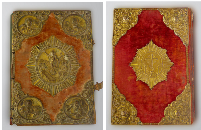
Figure 4: The cover of the Tetraevangelion