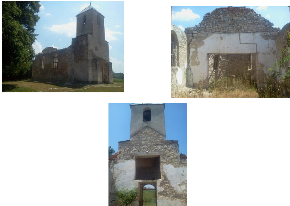
Figure 2: The remains of the church in Osredak after the civil war SFR Yugoslavia

The church of Saints Peter and Paul was built before World War I. The exact year is not known. At first it was planned to only build the bell tower as part of the church Vaznesenje Gospodnje (eng. Ascension of Our Lord) from the neighboring village called Vrelo. But the residents decided to build a subsidiary church made of wood instead of just the bell tower. During the World War II the church was severely damaged. In its place a new church was built out of solid material and it was consecrated by bishop of Banja Luka Andrej Frušić in May 1967. [7] At the beginning of the civil war in SFR Yugoslavia the church was once again seriously damaged (Figure 2), and the reconstruction of it commenced in 2012 initiated by former Serbian residents of Osredak and surrounding villages and their descendants.