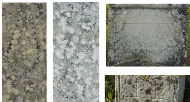
Figure 12: Examples of motives in shapes of flowers and twigs

On the head gravestones can be noticed different motives in shapes of flowers and twigs (Figure 12), as well as stars which represent the symbol of communism.