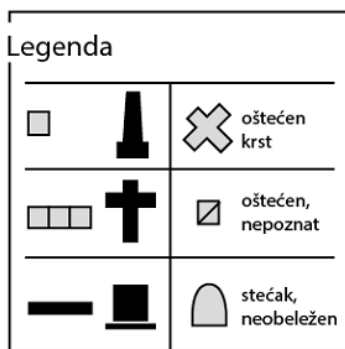
Figure 8: Legend of categories by which the gravestones had been marked on cemetery from left to right: pier, damaged cross, cross, gravestone of unknown shape type, plaque, tombstone

The head gravestones have been divided in 6 categories according to their shape and condition in which they were found. According to the shape, the head gravestones which have not been damaged are divided in pier , cross , plaque and tombstone . Tombstones do not have any motives or writing on them so it could not be identify from which period they are from. There are two categories of damaged head gravestones: damaged cross and gravestone of unknown shape type . Overturned crosses belong to category of damaged cross . The head gravestones from which only some parts are left and from which is impossible to determine the original shape and size belong to category gravestone of unknown shape type .