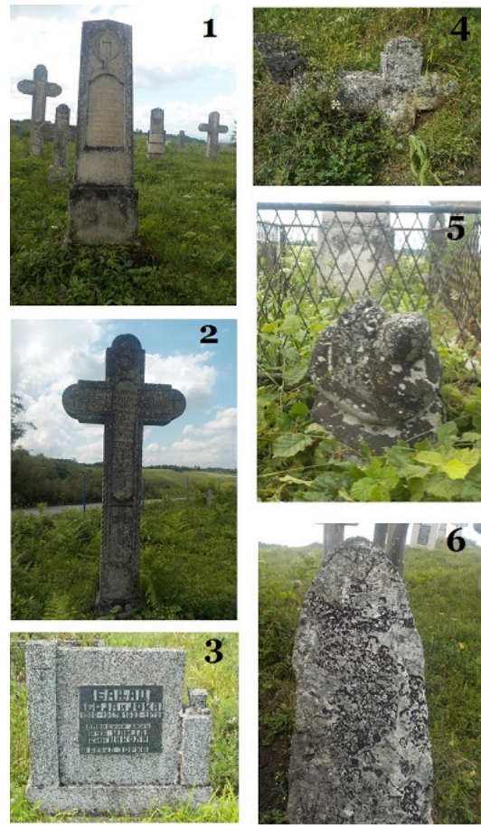
Figure 9: Examples of head gravestones of different categories: 1- pier, 2- cross, 3- plaque, 4- damaged cross, 5- gravestone of unknown shape type, 6- tombstone