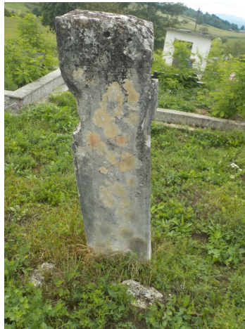
Figure 14: The head gravestone ornamented with a symbol of the star of David

One head gravestone stands out from the others, as it is in a shape of a pier without any text but it has engraving of a symbol of the star of David (Figure 14). It is assumed that the deceased was of Jewish religion. According to [1] few Jewish families migrated to this area in second half of 19th century.