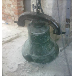
Figure 3: The bell of the church of Saints Peter and Paul in Osredak

The bell for the church was purchased in 1924 by donation of the residents from Osredak and Gradina. According to the original writing on the actual bell, it was cast in Belgrade in an iron foundry called Balkan. Due to the fact that the church after the civil war was left only with the outside walls, the bell was temporarily given to the church in the village called Radic. When the bell tower was reconstructed and the roof on the church was built the bell was returned to Osredak in June 2014 (Figure 3).