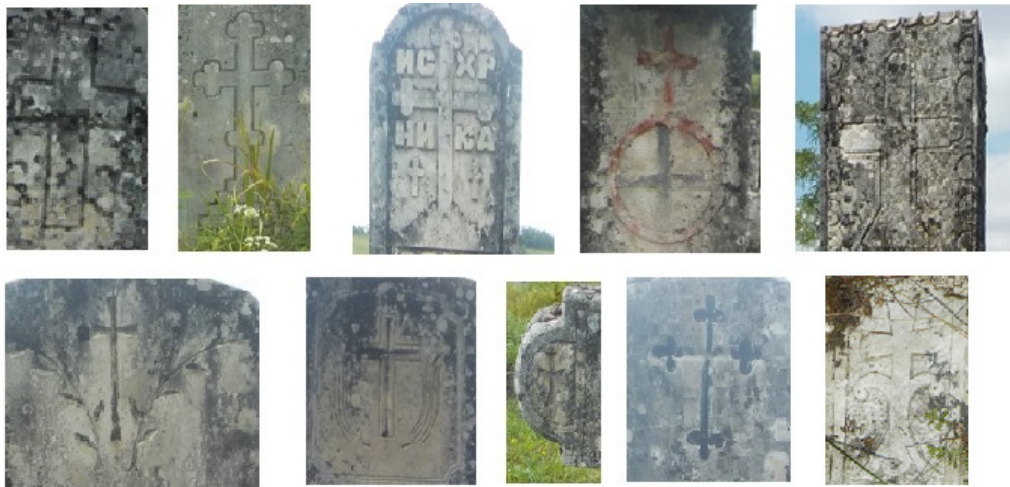
Figure 10: Examples of different crosses on the head gravestones

head gravestone. Besides the cross appearing on top of the front side, it also appears on the bottom or on the horizontal edges of the front side of the head gravestones. Small number of head gravestones has ornamented sides with symbols of crosses.