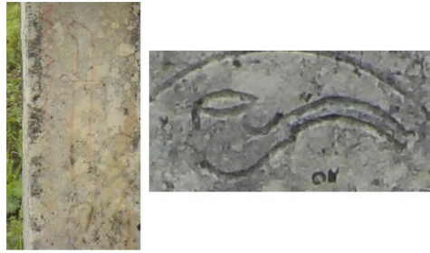
Figure 13: Examples of motives of weapons and tools

Some of the head gravestones are decorated with borders. It can be noticed that the older head gravestones were decorated with motives using red color. During the classification of the noticed motives, the description of motives in [8] were used.