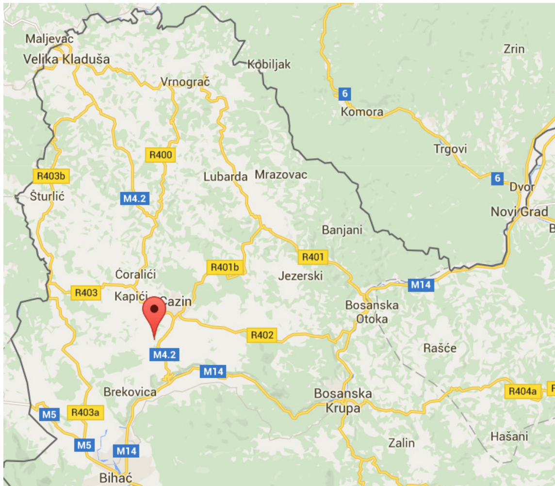
Figure 1: Map of part of Bosnia and Herzegovina in scale 1:400000. Village Osredak is labeled with the red mark.

u Bosanskoj krajini [1]. According to his findings, during the Dubica War (the last Austrian-Ottoman war, 1788–1791), when Austria tried to take over the Bihac Frontier, the Serbian residents of this area had to leave their homes and there were no Serbs in this area for 30 years. After which two families (Grbić and Marić from Dalmatia) were the first ones to settle in Osredak. In the first half of the 19th century fifteen more families migrated to Osredak and settled there. Three families were from Dalmatia (Crnobrnja, Marčeta, Grmuša), eight families were from Zmijanja (Majkić, Brkljač, Šteković, Banjac, Vuković, Lešić, Karanović, Rađenović) and four families were from Lika (Vignjević, Bogunović, Vojinović, Majstorović). Before World War II eight more families (Baglava, Čavić, Bokan, Dukić, Pavković, Zubović, Smiljanić and Jelač) migrated to Osredak. There is no record of where the four families (Džolić, Milošević, Mimić, Bošnjak) came from.