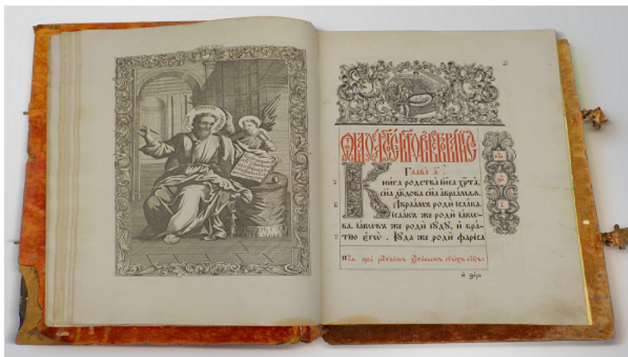
Figure 6: The beginning of gospel of Matthew

The Tetraevangelion was printed in Russia and it was made in hard cover with red plush. The size of the pages are 25 by 39 cm. It is ornamented with metal clutches and brassy embossed decoration. The embossed decorations on the corners of the front cover show all four evangelists with their accompanying symbols. While in the center of the front cover is Jesus. The embossed decorations on the back cover represent the Russian cross. All elements on the cover are well preserved, but the material has been damaged, especially on the front cover (Figure 4). The Tetraevangelion consists of 976 pages written in old church Slavonic language. All the pages have been preserved in excellent condition. The text has been written in black and red colors and some pages are decorated with graphics. The beginning of each gospel is decorated with the image and motives of the evangelist. On Figure 6 the beginning of the gospel of Matthew has been shown.