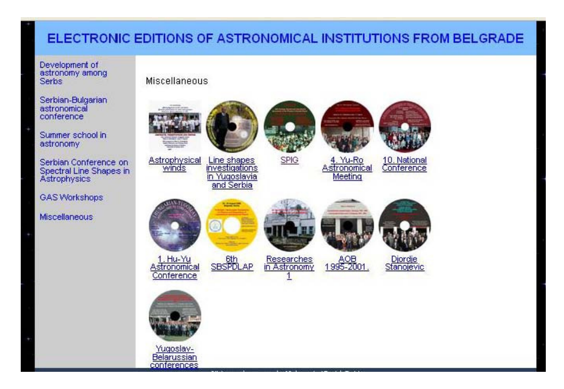
Page in the SerVO with eleven electronic publications in the group Miscellaneous .